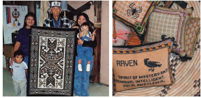
From left: Historic Toadlena Trading Post; The Common Thread.

37. GALERIA DE DON CACAHUATE | Abiquiú, Private Drive 1625 #8 Apr-Oct, T-SU, 9-5; Nov 1-Mar 30, TH-M, 10-5 505.685.0568 From Hwy 84 in Abiquiú, across from Bode's General Merchandise, turn up hill into old Abiquiú village. South of St. Thomas Church, Private Drive 1625 is on left. 🚗 ♿