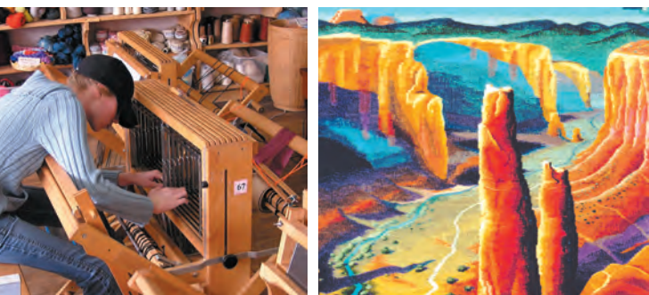
From left: Española Valley Fiber Arts Center; Española Valley Fiber Arts Center (detail of tapestry).