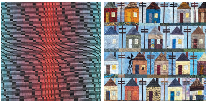
From left: Española Valley Fiber Arts Center; Percha Creek Traders Co-op.