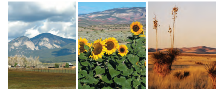
From left: Taos Pueblo land and Taos Mountain; Urban Eagle Herb Co. & Farms' Hopi dye sunflowers; The road between Deming and Silver City.

Trails sites have participated in an application process and are ready for company, in three regions: North Central, Northwest, and South. The work of more than 200 New Mexico fiber artists awaits you at 71 destinations. So pack a good map of New Mexico and hit the trails!