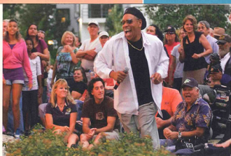
One of The Funk Brothers performing off-stage in front of the audience at Wingfield Park during the 2009 Opening Night of the Artown Festival.

Each July the Artown Festival in Reno, Nevada, attracts approximately 309,000 visitors who take part in more than 350 events at more than 100 locations citywide, including outdoor amphitheatres, churches, and coffee shops. Created to reenergize the city's failing economy, the multidisciplinary festival offers 31 days of exposure and marketplace opportunities for artists and arts organizations, 93 percent of which are local to the area. Many festival activities are free-of-charge, giving more people access to the multitude of arts experiences. Artown received an NEA Access to Artistic Excellence grant of $20,000 to support the 2010 event, including kid-friendly hands-on art workshops, a Monday night music series, an outdoor