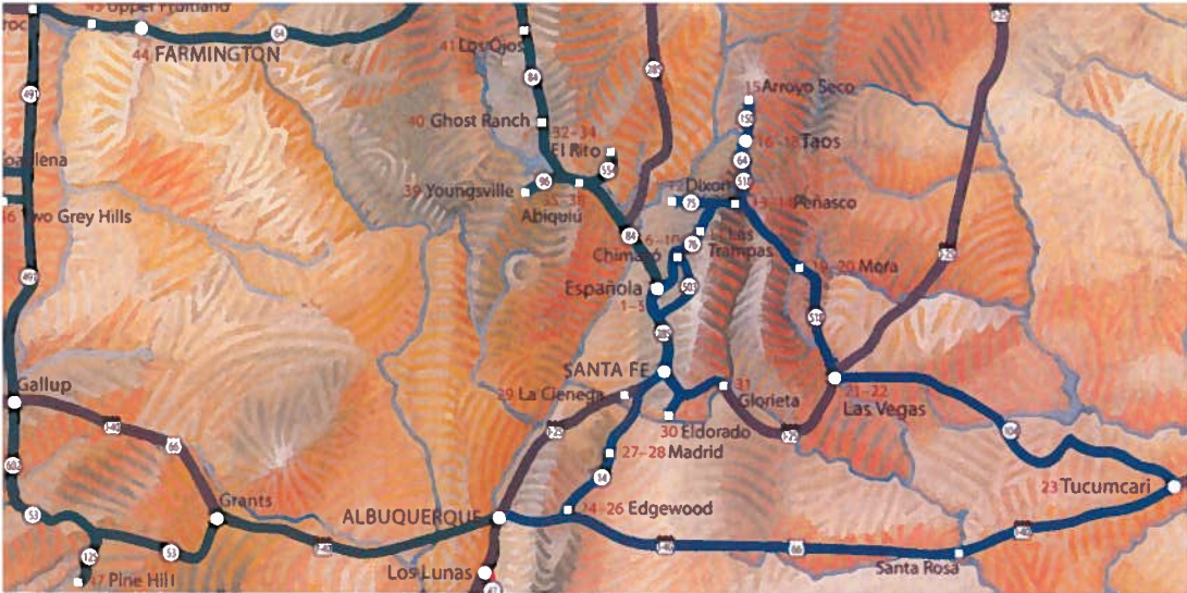
The New Mexico Fiber Arts Trails: the south side of the North Central Loop is shown in blue.