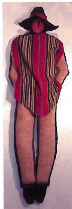
MIDDLE: The Tapestry Gallery of Madrid, New Mexico, carries handwoven clothing, rag rugs, art dolls and other fine fiber art by more than thirty artists.