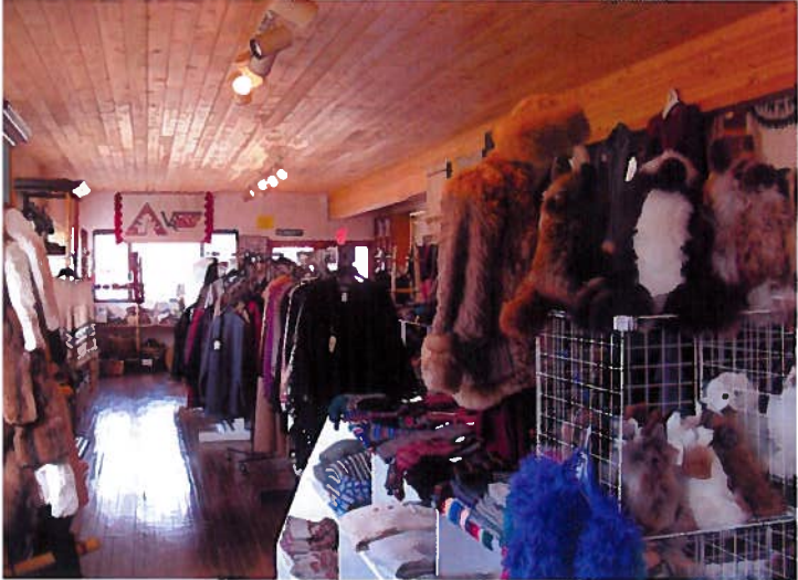
MIDDLE: Tapetes de Lana houses a weaving studio and a gallery.